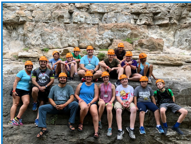
Junior High Youth attended Camp Eagle Returned July 1, 2019