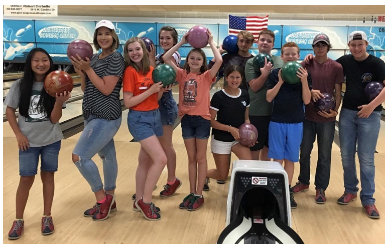
Youth at Crossroads Bowling—July 16, 2019