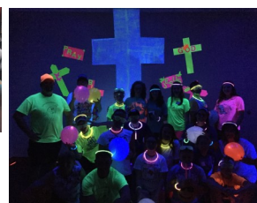
Black Light Room