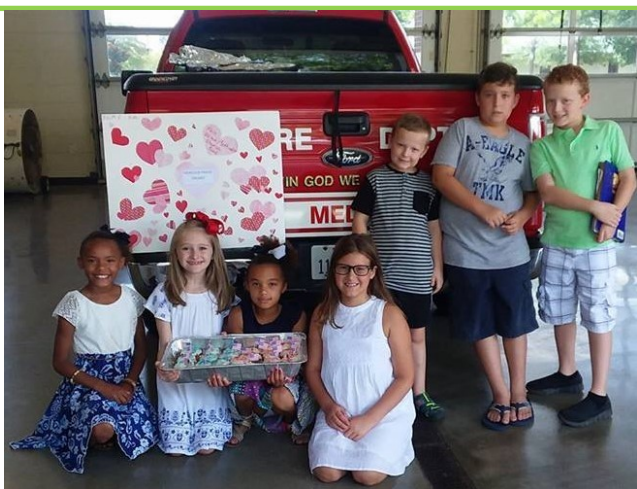
First United Methodist Church Sunday School students made cupcakes and a “Heroes Have Heart” poster to share with local firefighters on July 2!

Call church office at 886-7466 to serve!