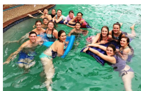
Swim & Scripture