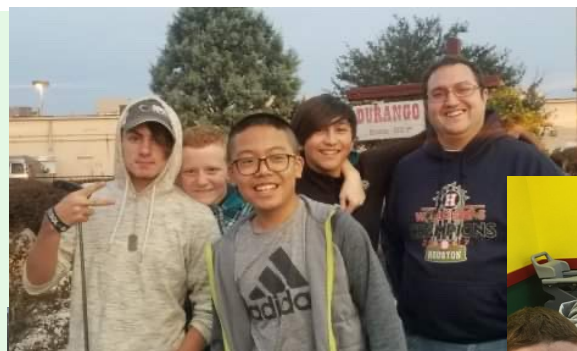
Colorado Canyon Putt Putt on November 17