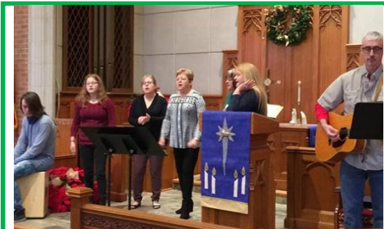
December—Praise Service worshipped in the Chapel!

This year we were able to shop for 60 people all impacted by Hurricane Harvey. We had 14 amazing adults who sacrificed their Sunday in order to shop, cook, wrap gifts, hang out with youth and kids all day, and more. It was another wonderful year, and everyone had a wonderful time. Thank you especially to those who donated and made this trip possible for everyone.