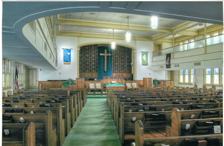
Figure 3. FUMC- Orange Sanctuary present