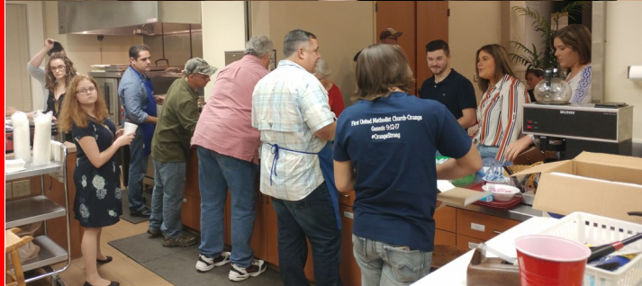
December 3— 1st Kids production of "The First Leon" followed by The Grillin' Group's gumbo fundraiser to support the Youth Angels & Elves shopping trip!