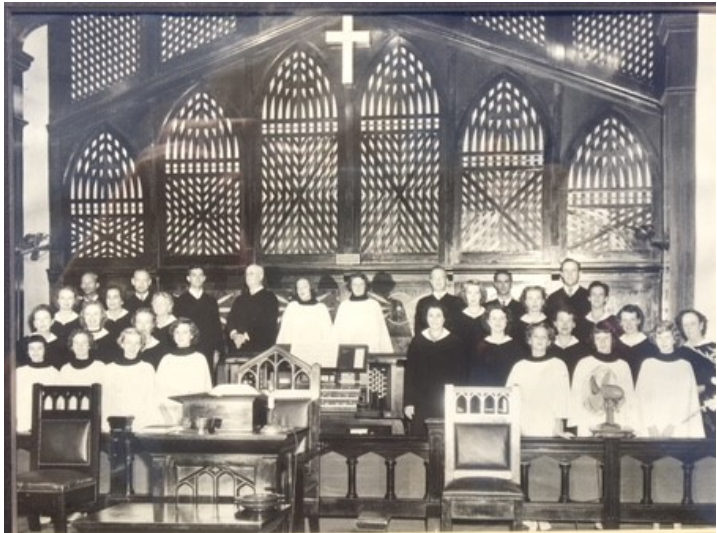
Figure 2. FUMC- Orange Sanctuary in 1952