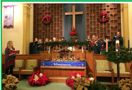
December 17—Chancel Choir presented their annual Christmas Cantata!