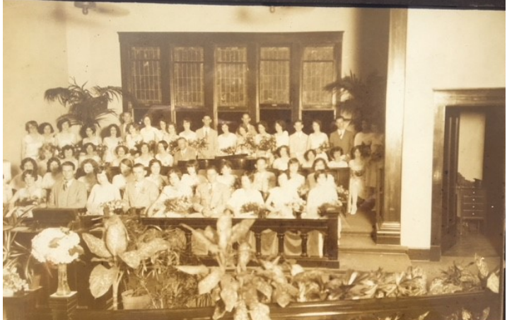
Figure 1. FUMC- Orange Sanctuary in 1929

Path Forward: An architect is being consulted to ensure the proposed renovation project maintains the historic features of the Sanctuary worship space while modernizing it. Several Sanctuary renovation projects have been completed since the Sanctuary opened in 1921, nearly 100 years ago (see below). We are the beneficiaries of the forward-thinking Saints who sacrificed that we could worship in the Sanctuary in its current configuration. The proposed Sanctuary renovations allow us to pay that forward by making this beautiful space even more conducive to worship for ALL !