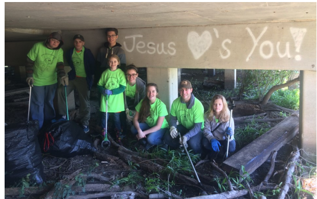
FUMC Youth Cleaning Graffiti