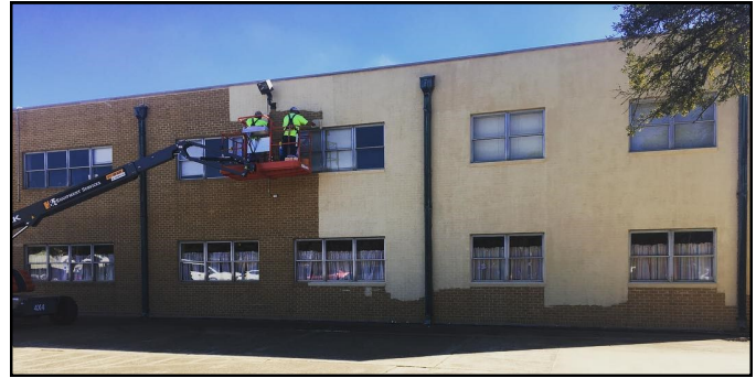
Painting the Education Building