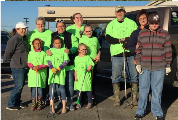
FUMC Cleaning Orange Streets