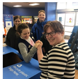
Oh My! You're Strong!