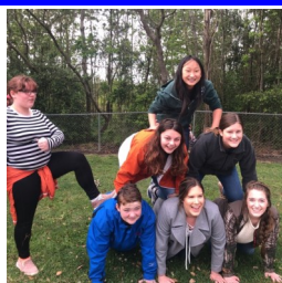
Egypt—Here We Come!

If you haven't been Safe Sanctuary trained in the last two years and want to work with youth and children, you need to be trained. Safe Sanctuary is a policy that promotes child safety. All adult leaders in our church are required to certify that they are familiar with the policy and will follow it when working with children and youth in the church. (Training also on June 2 at 10 a.m.)