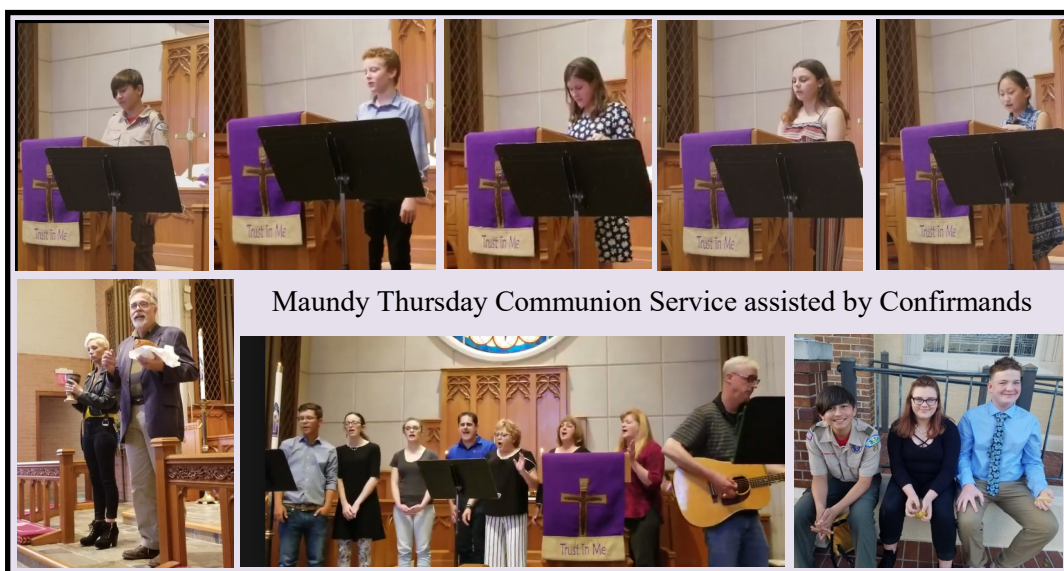
Maundy Thursday Communion Service assisted by Confirmands