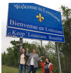
Welcome to Louisiana!