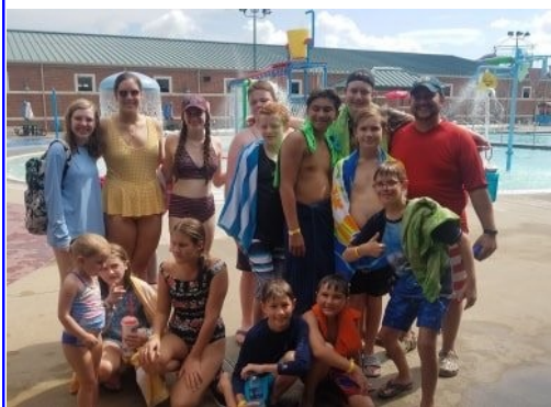
SPAR Waterpark (Sulphur) August 7, 2019