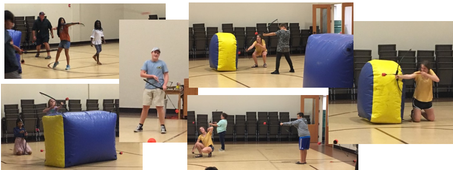
C.R.E.W. Kicks of New School Year with Arrow Tag! August 25, 2019

Sunday, September 22 Christian Education Sunday