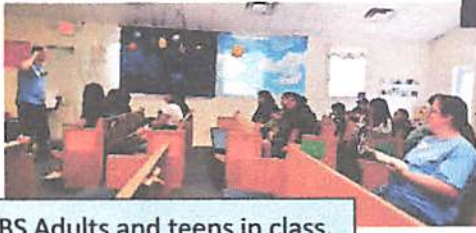
VBS Adults and teens in class.