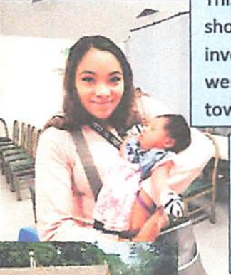
This is one of our very first bus kids. She has moved to Idaho Falls. She brought her newborn to church.