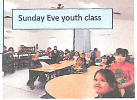
Sunday Eve youth class