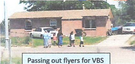
Passing out flyers for VBS