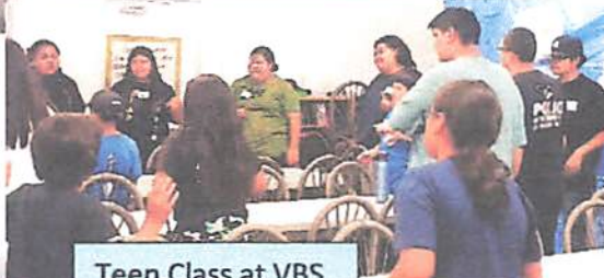
Teen Class at VBS