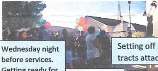
Setting off balloons with tracts attached for VBS.